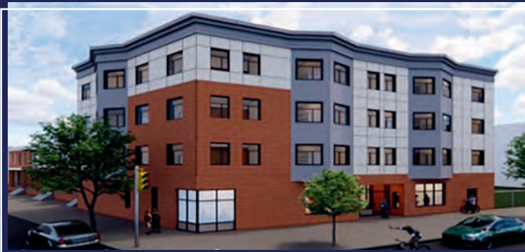
LINDA LOCKMAN KING APARTMENTS 35 units