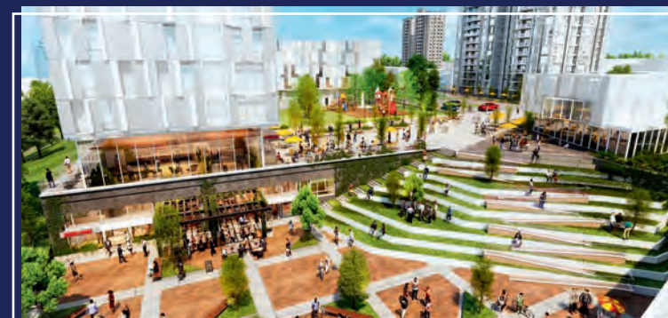
WESTPARK REDEVELOPMENT 41 units