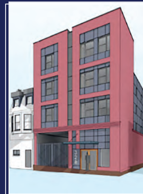
THE QUEEN SR. APARTMENTS 49 units for seniors