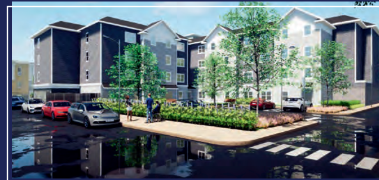
GOOD SHEPHERD 55 units of senior housing