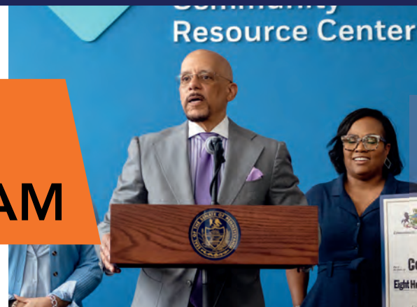
SENATOR VINCENT HUGHES

Building on that success, the new budget boosts funding for the program from $40 million to $56 million .