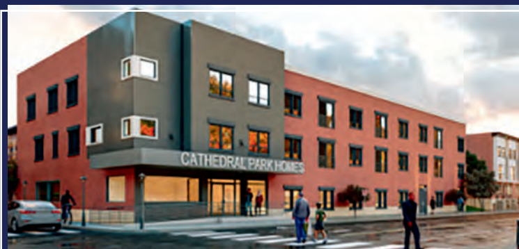
GAUDENZIA CATHEDRAL PARK HOMES 40 total units