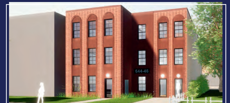
THE APARTMENTS AT 40TH STREET PLACE 40 units 11 one bedroom