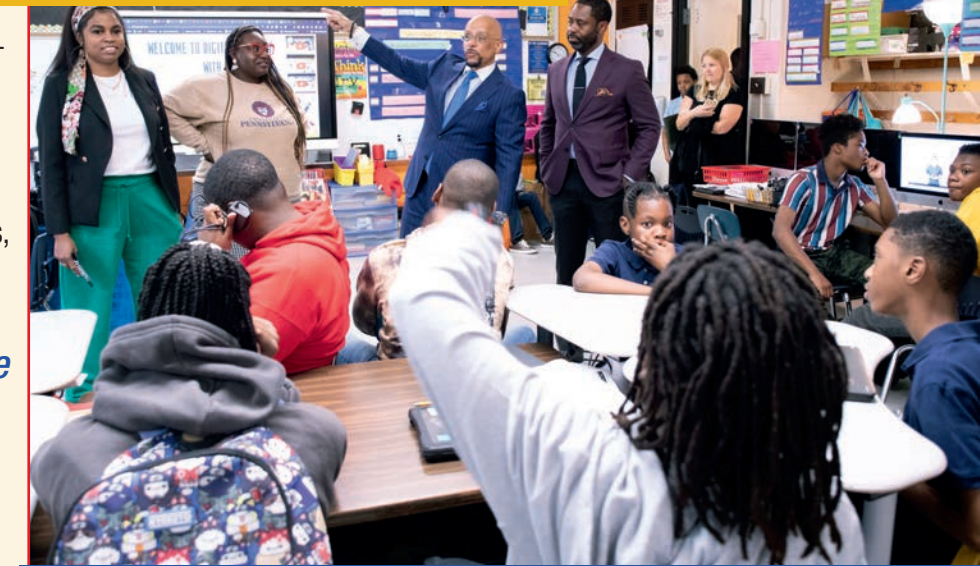
Over 140 professionals spoke across 13 different schools in Philadelphia.

"I wanted students to hear from people who look like them and live in their neighborhoods. The goal was to teach these young people about the power of education, hard work, and believing in themselves." – Senator Hughes